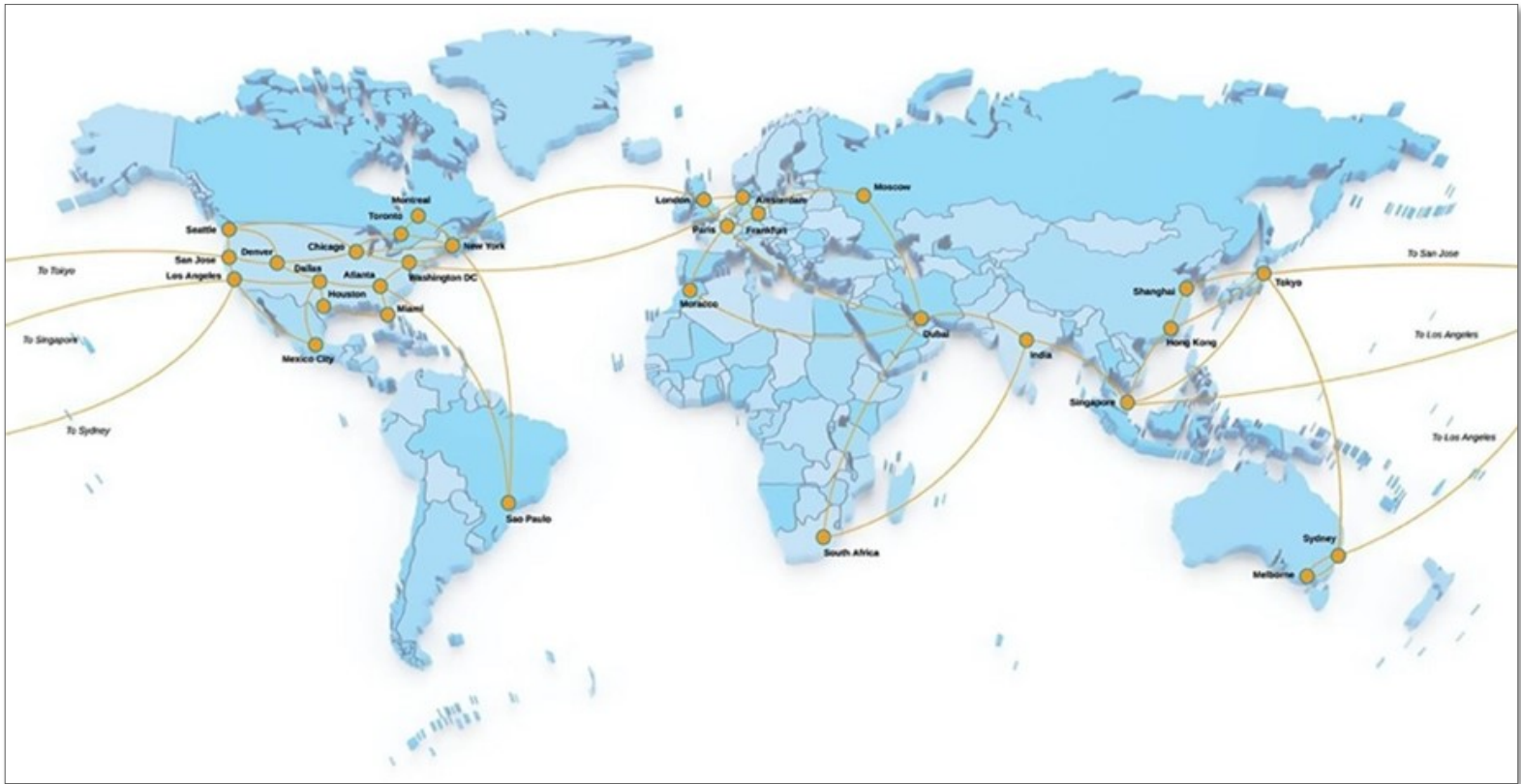
Figure 1: Instant's Global Private Network Infrastructure.